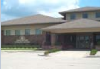
Outpatient Rehabilitation Center