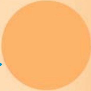
Girls on the Run