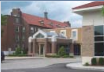
Margaret Mary Community Hospital