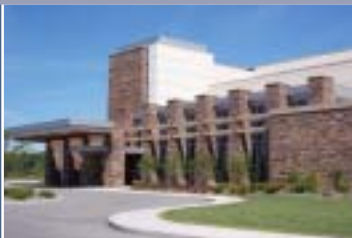
The Hansen Center